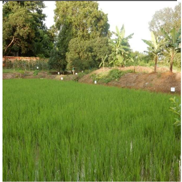
Paddy seed production unit