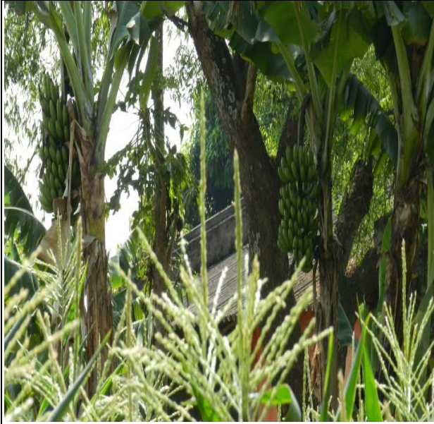
Banana in pond dyke