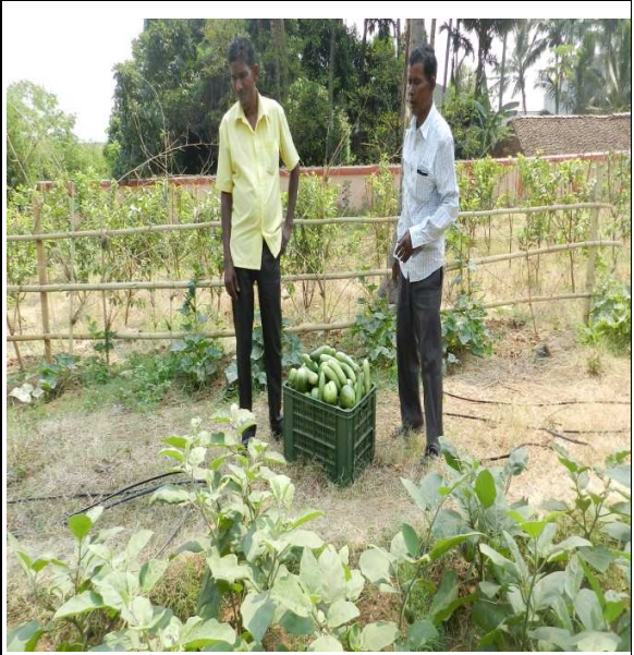
Seasonal vegetable cultivation unit